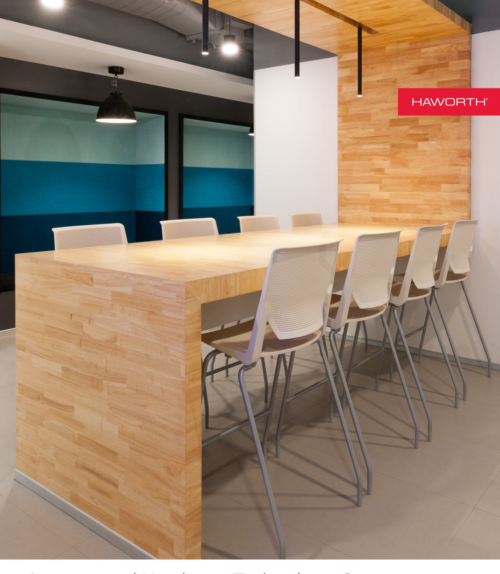
International Heathcare Technology Company Bangalore, India