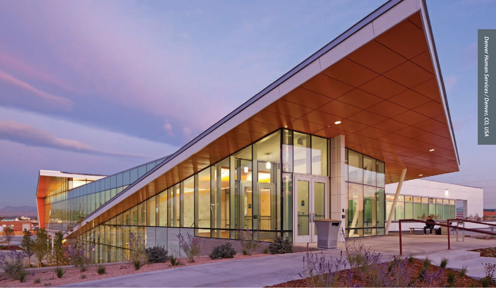
Denver Human Services / Denver, CO, USA