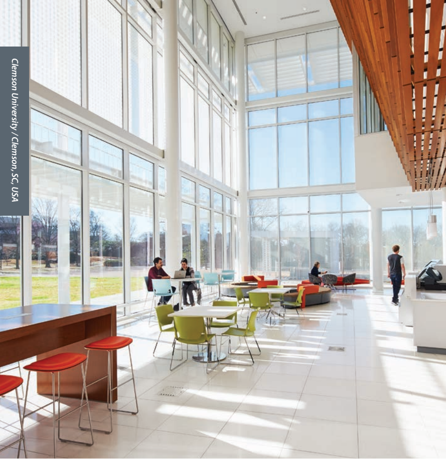
Clemson University / Clemson, SC, USA