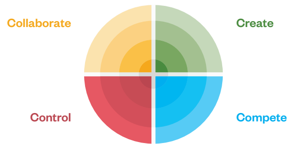
Collaborate Culture Do things that last

In order to enhance the performance of your people, organization, and facility, it’s important to understand cultural implications—what people value and how it affects space. Leveraging the Competing Values Framework, we looked at organizational and individual needs by culture type: Collaborate, Create, Control, and Compete.