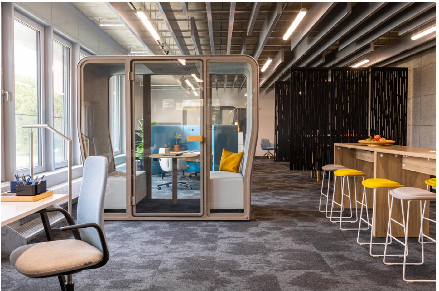
The “BuzziNest “ telephone booth from BuzziSpace offers space for confidential conversations